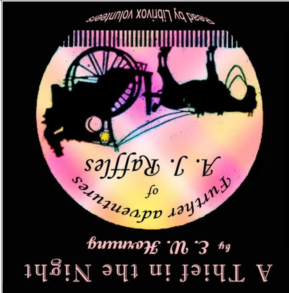
Cover image from 1st Canadian edition, Toronto: McLeod & Allen, 1905 Cover design for Librivox by Michele Fry

Easy Folding Instructions for this Origami CD case, including step by step photos, can be found here . Can also access from the LV Wiki page, CD Covers.